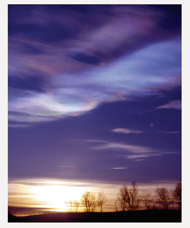
Figure Q10-2. Polar stratospheric clouds. This photograph of an Arctic polar stratospheric cloud (PSC) was taken from the ground at Kiruna, Sweden (67°N), on 27 January 2000. PSCs form in the ozone layer during winters in the Arctic and Antarctic stratospheres wherever low temperatures occur (see Figure Q10-1). The particles grow from the condensation of water and nitric acid (HNO<sub>3</sub>). The clouds often can be seen with the human eye when the Sun is near the horizon. Reactions on PSCs cause the highly reactive chlorine gas CIO to be formed, which is very effective in the chemical destruction of ozone (see Q9).

Arctic Polar Stratospheric Clouds (PSCs)