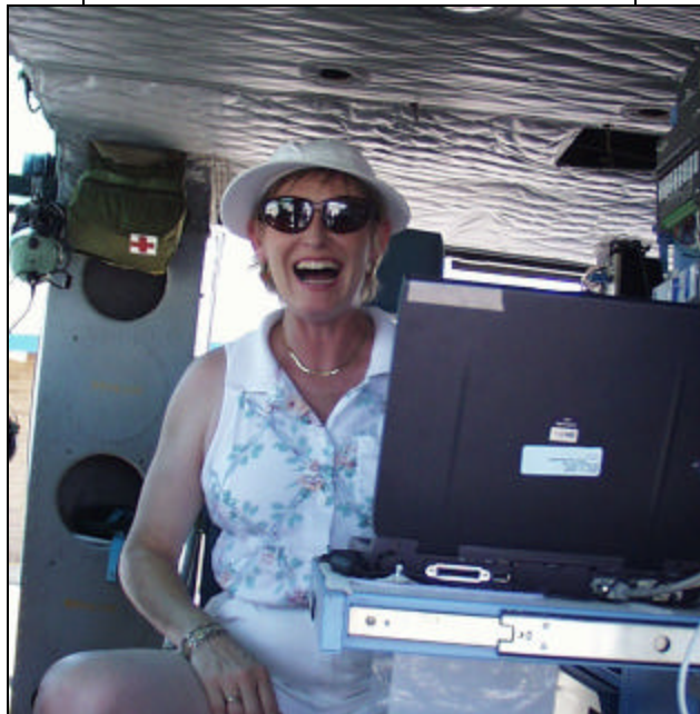
Our Cheerful, Courteous Staff is Happy to Serve You!!!