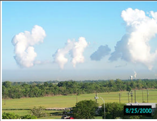
Plumes from Ship Channel businesses punch through inversion and initiate formation of cumulus clouds (8:30 AM)